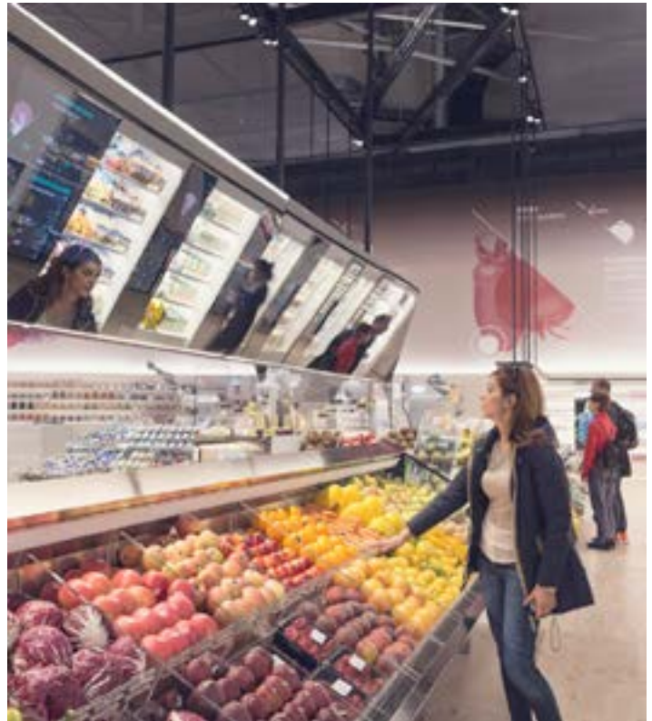
Digital augmented store at Expo Milano 2015. Courtesy of Coop Italy